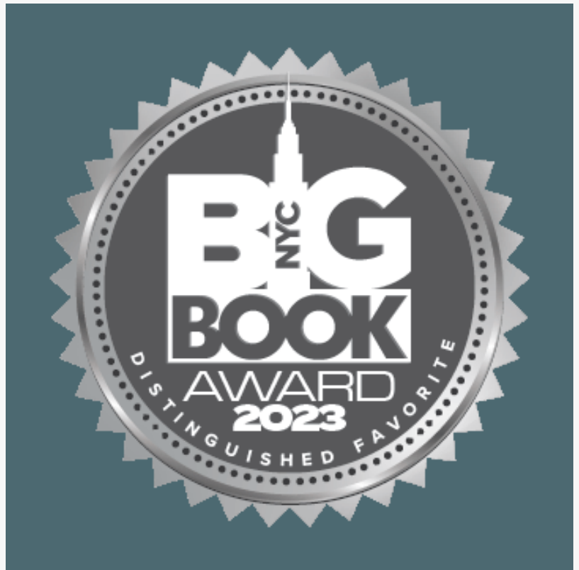
NYC Big Book Award 2023 Distinguished Favorite