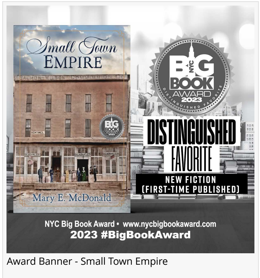
Award Banner - Small Town Empire

The competition is judged by experts from different aspects of the book industry, including publishers, writers, editors, book cover designers and professional copywriters. Selected award winners and distinguished favorites are based on overall excellence.