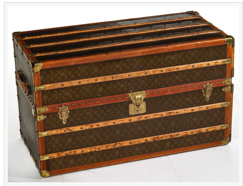
Rare circa-1920 Louis Vuitton chassure (shoe trunk), likely a commissioned piece, estimate $6,000-$8,000

An impressive European artwork in the auction lineup is the 1928 Portrait of