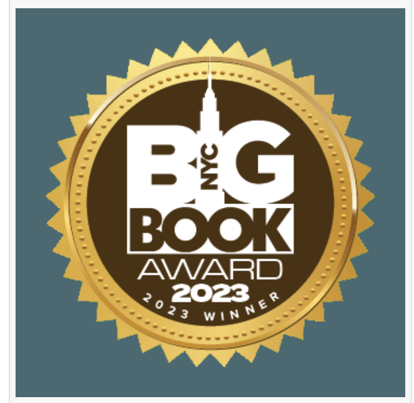
NYC Big Book Award 2023 Winner Seal

"Our team is honored to highlight the excellence and achievements of a diverse array of authors