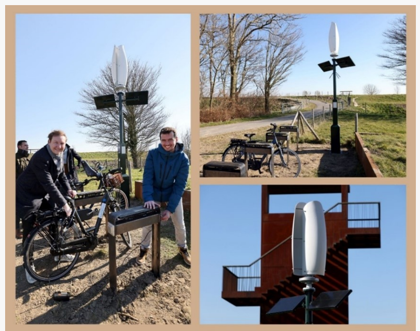
ZW Charging Station in Nissewaard

https://www.nissewaard.nl/nieuws-1/flowerpower-voor-je-elektrische-fiets-in-de-beningerslikken.htm