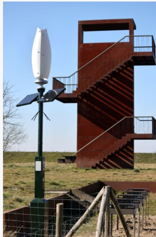
Flower Turbines Charging Station Near Observation Tower in Nissewaard

This press release can be viewed online at: https://www.einpresswire.com/article/659261218