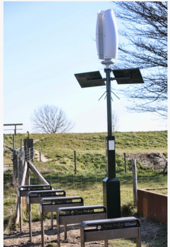
Flower Turbines Charging Pole at Nissewaard