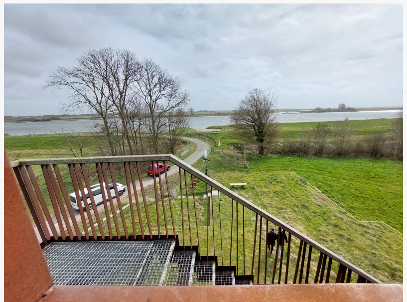
Flower Turbines Charging Station in Nissewaard View From Tower