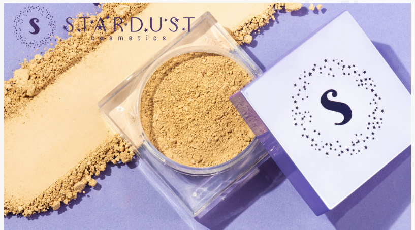
Stardust Cosmetics' Mineral Foundation Powder