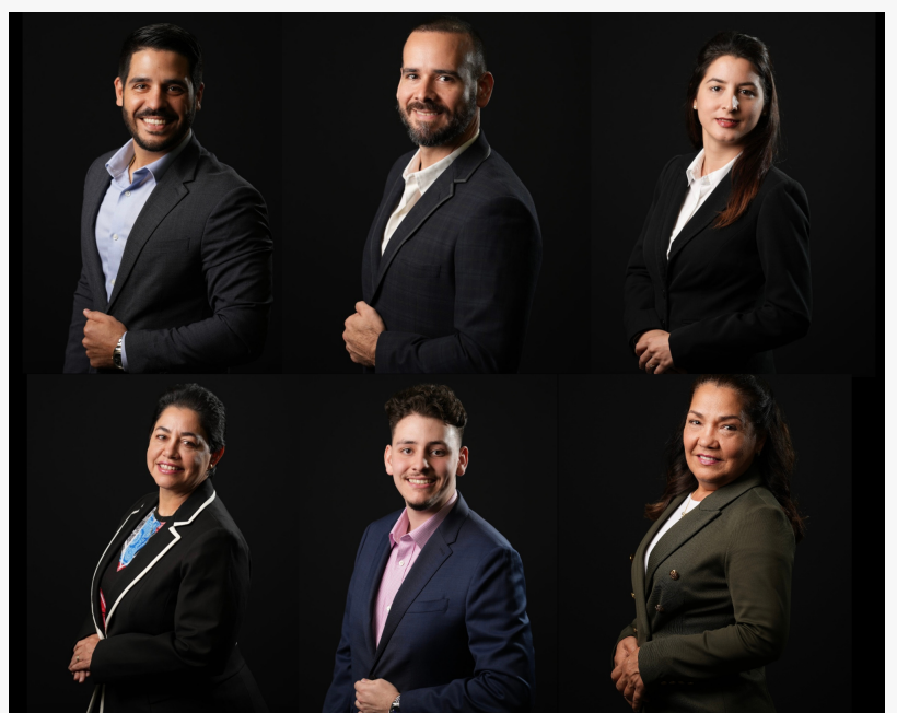
SMAART Company executive team