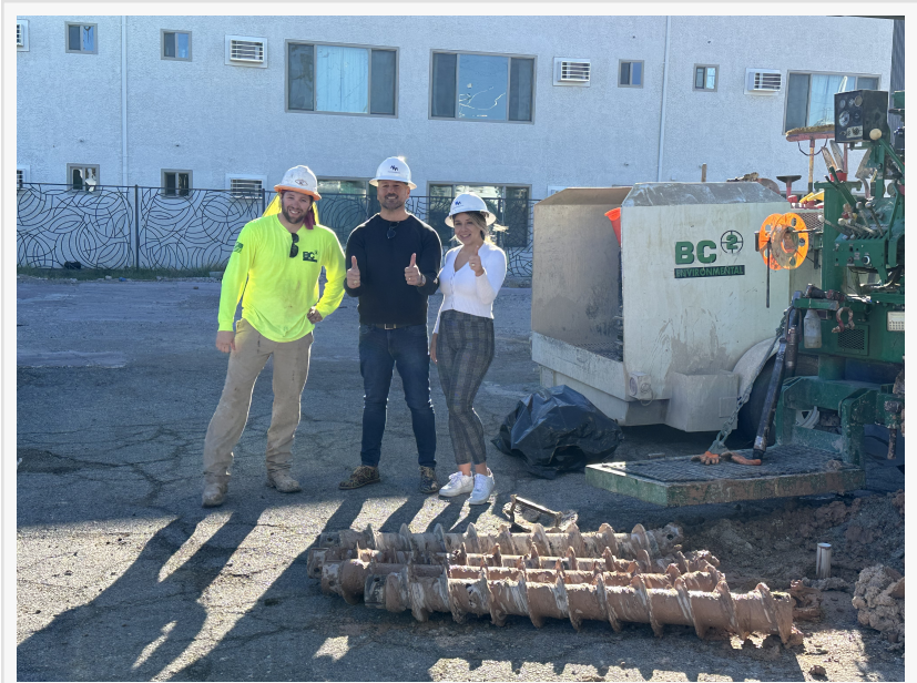
Zilberberg International Acquires Mixed-Use Prime Las Vegas Property