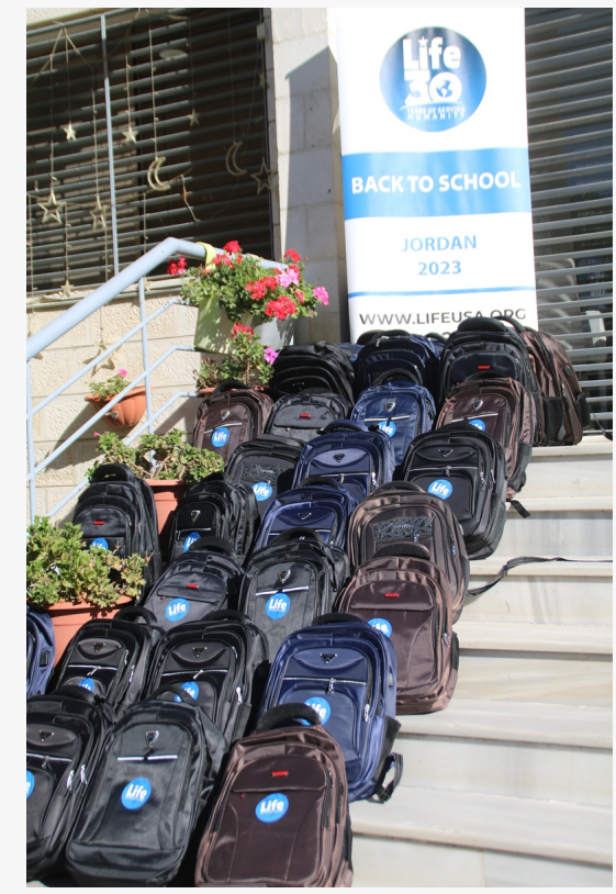
Back-to-School in Jordan