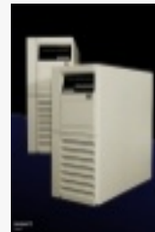
3 and 5 KW models

The Linear/1 UPS manufactured by accratech, Inc. certified UL 60601-1, the Last word in perfect power providing safe conditioned, continuous electrical power for your professional medical team using sensitive critical medical equipment.