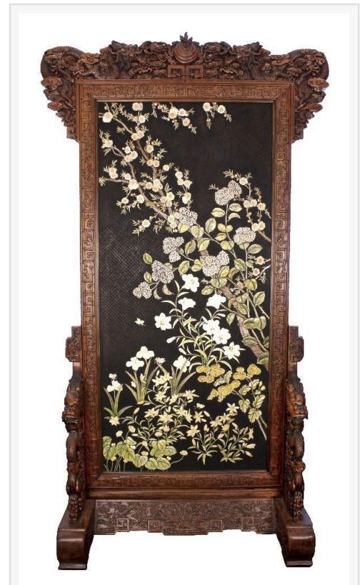
Elaborate Chinese Qing Dynasty inlaid hardwood palace screen, 82in high x 39in wide x 24 3 / 4 in deep. Estimate $30,000-$50,000

This press release can be viewed online at: https://www.einpresswire.com/article/659471749