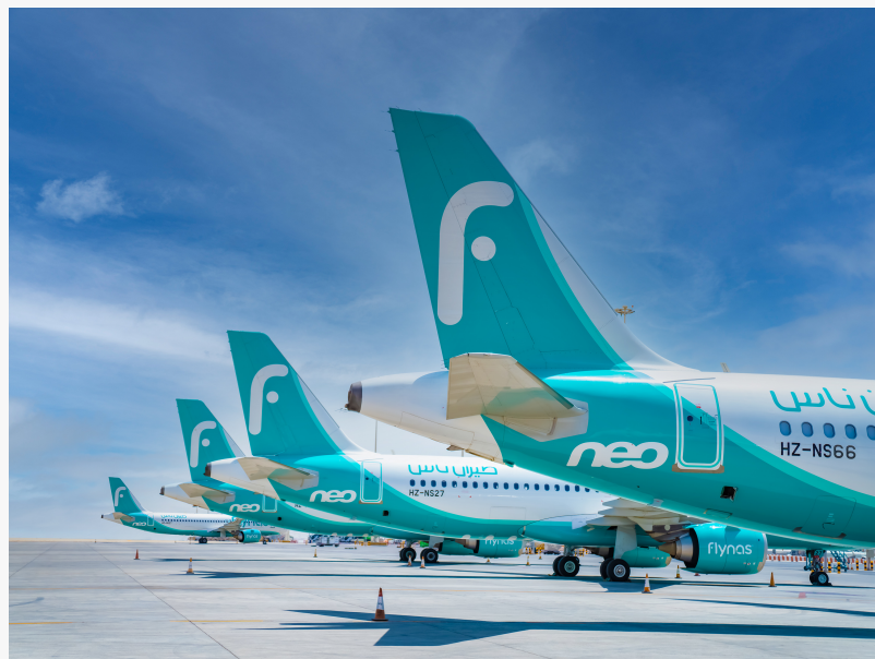
5 New Air Crafts

This press release can be viewed online at: https://www.einpresswire.com/article/659576081