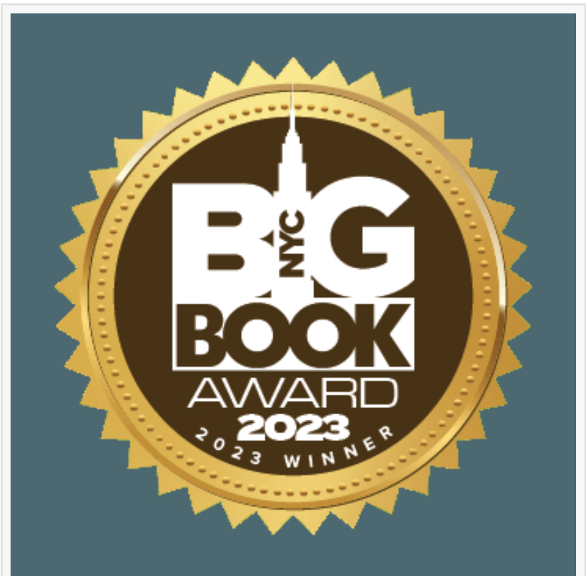
NYC Big Book Award 2023 Winner Seal

Journalists, well-established authors, small and large presses, and first-time independent authors participated in remarkable numbers. This year, awardees hailed from Blackstone Publishing, Berrett-Koehler, Beyond Words, Casemate, Cinnabar Moth Publishing, Citrine Publishing, Four Way Books, Fantagraphics, Greenleaf Book Group Press, Ideapress, Inner Traditions, Kogan Page, Ooligan Press, Riverhead Books, Rutgers University Press, She Writes Press, Story Monsters Press, Teacher Created Materials, The Wild Rose Press and the White House Historical Association.