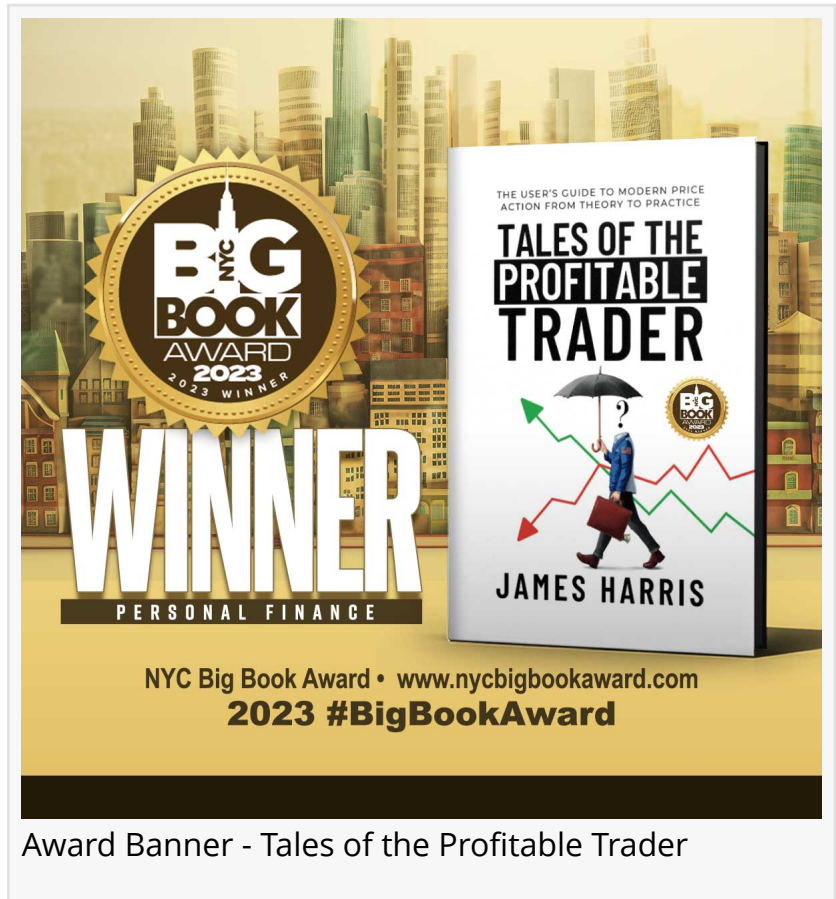
Award Banner - Tales of the Profitable Trader