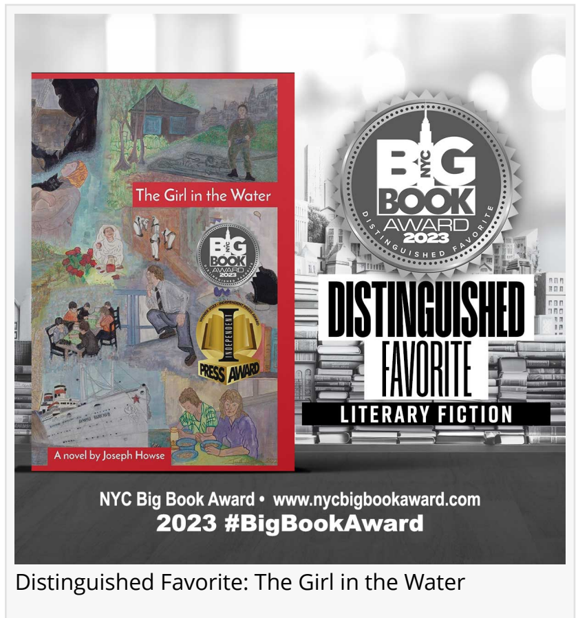
Distinguished Favorite: The Girl in the Water

The novel is set against the backdrop of a failing civilization that sees non-cooperation and unhappiness as a disease. The young characters search for themselves within this society, often through acts of rebellion and nonconformity.