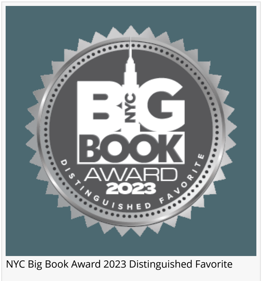
NYC Big Book Award 2023 Distinguished Favorite