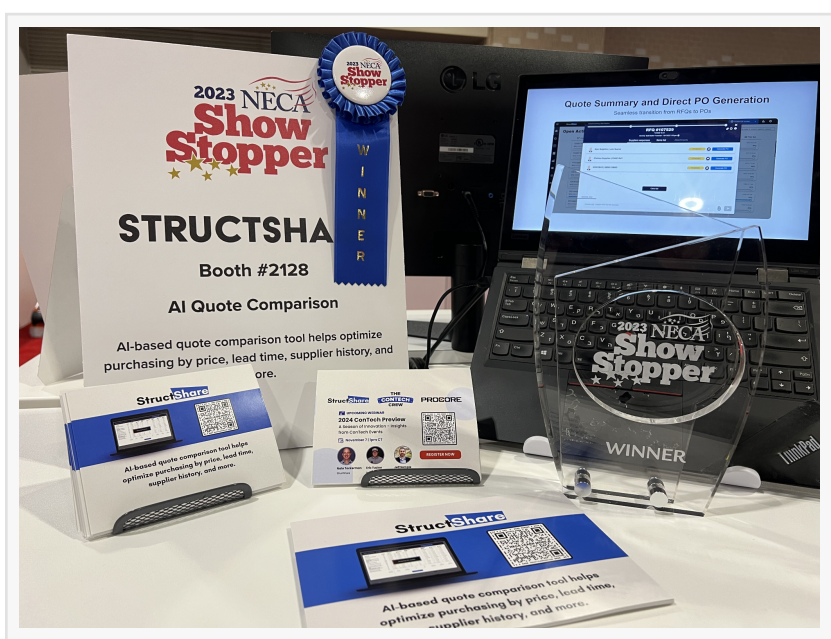
StructShare's GenAl to revolutionize how construction professionals purchase and manage materials

AUSTIN, TEXAS, UNITED STATES, October 13, 2023 /EINPresswire.com/ --StructShare, the leading procurement platform for specialty trade contractors continues pushing the envelope with the launch of GenAI to revolutionize how construction professionals purchase and manage materials. This pioneering step demonstrates StructShare's commitment to harnessing advanced technology to deliver intuitive solutions that increase efficiency and accuracy of communication from the field to the office to the supplier.