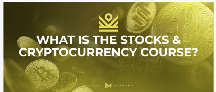
Stocks and Cryptocurrency