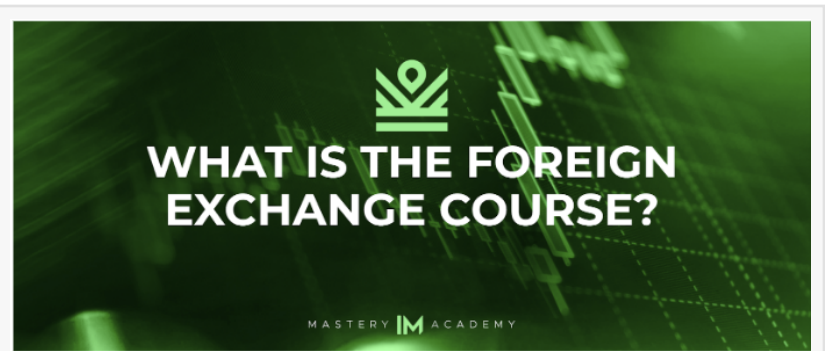
Foreign Exchange Course

IM Mastery Academy students can choose to study one or several financial markets. Courses and strategies are divided into the following five courses, organized by subject matter: