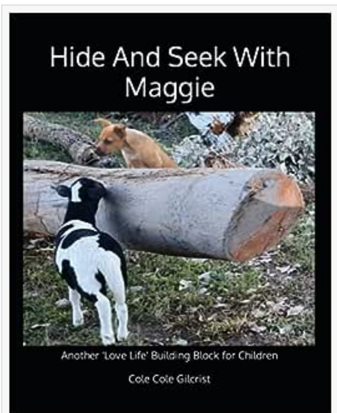
Hide And Seek With Maggie the lamb book cover