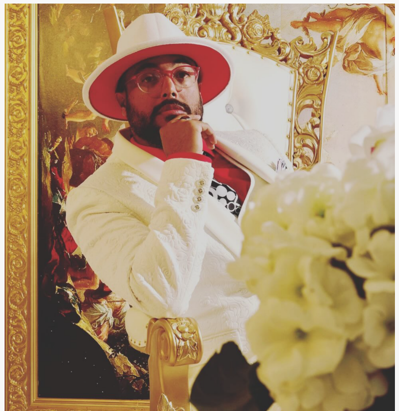
Cliff Beach, American Singer/ Songwriter/ Music Producer/ Author

This press release can be viewed online at: https://www.einpresswire.com/article/660110488