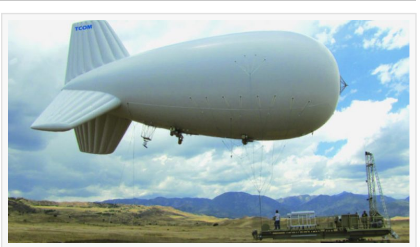
TCOM's aerostat systems are essential gap fillers in the 1st and 2nd Island Chain defenses."

COLUMBIA, MD, UNITED STATES, October 6, 2023 /EINPresswire.com/ --As a global leader in multi-domain C5ISR elevated awareness solutions, TCOM, L.P. will exhibit and introduce its latest AI-enabled solutions for Distant Warning and Awareness, Critical Infrastructure and Force Protection, and Maritime and Border Security