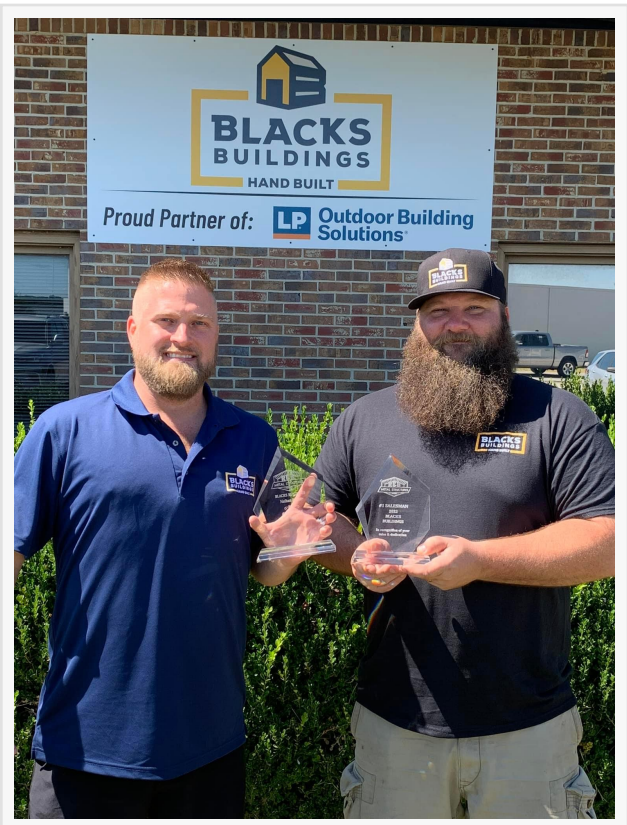
Blacks Buildings, based in Lebanon, Tennessee is the No. 1 Dealer of R&B Metal Structures for three consecutive years.

Matt Black Blacks Buildings +1 615-587-0923 info@blacksbuildings.com