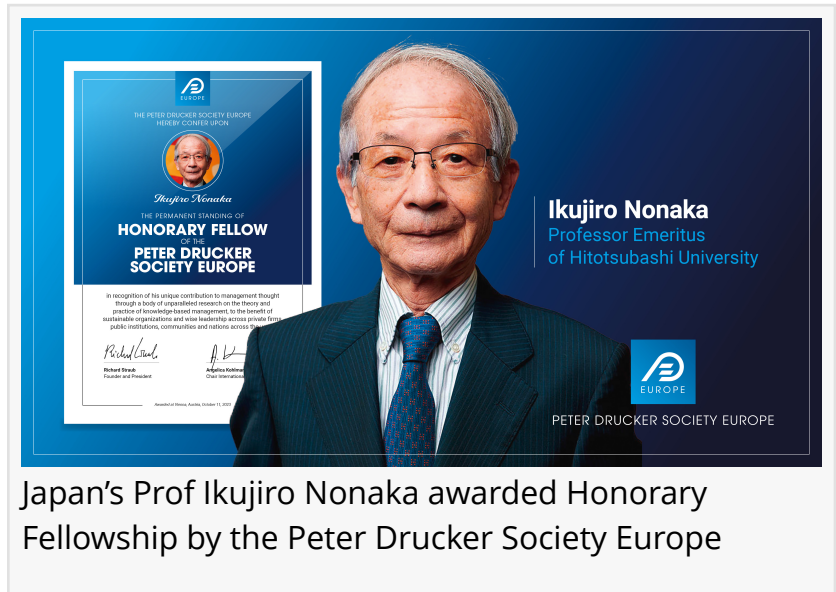
Japan's Prof Ikujiro Nonaka awarded Honorary Fellowship by the Peter Drucker Society Europe

VIENNA, AUSTRIA, October 11, 2023 /EINPresswire.com/ -- Ikujiro Nonaka, Professor Emeritus of Hitotsubashi University, conducting research activities at the Hitotsubashi University Business School, School of International Corporate Strategy, has been awarded the 2023 Honorary Fellowship of the Peter Drucker Society Europe , it was announced today.