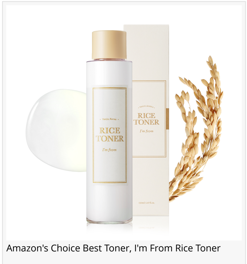
Amazon's Choice Best Toner, I'm From Rice Toner

Formulated from top-notch Korean skincare ingredients, the Rice toner has captured the hearts of beauty enthusiasts worldwide with its extraordinary formula and exceptional results. Sourced from the heart of Korea, this toner is a testament to the country's renowned beauty and skincare industry. Its key ingredient, rice extract, makes up an impressive 77.78% of the product, making it a powerhouse for collagen production and skin hydration. The high-water retention properties