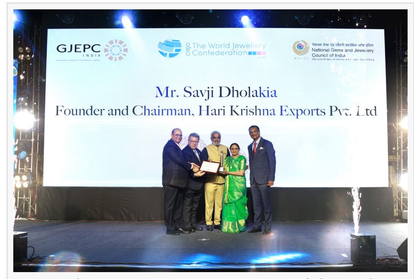
Hari Krishna Exports Promotes Sustainability and Collaboration at CIBJO Jaipur

as an international confederation, uniting national jewellery trade organisations from over 45 countries. Its mission is to promote harmonisation, international cooperation, and responsible sourcing, playing a pivotal role in addressing global challenges concerning the jewellery industry while ensuring consumer confidence.