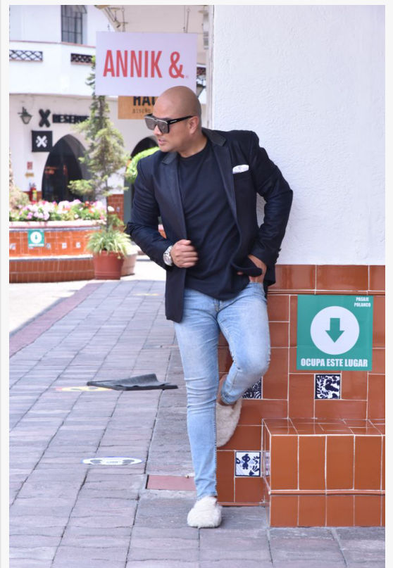
ANNIK & Diego Barrios TV Presenter and Personality wearing casual loafers

This press release can be viewed online at: https://www.einpresswire.com/article/660340967