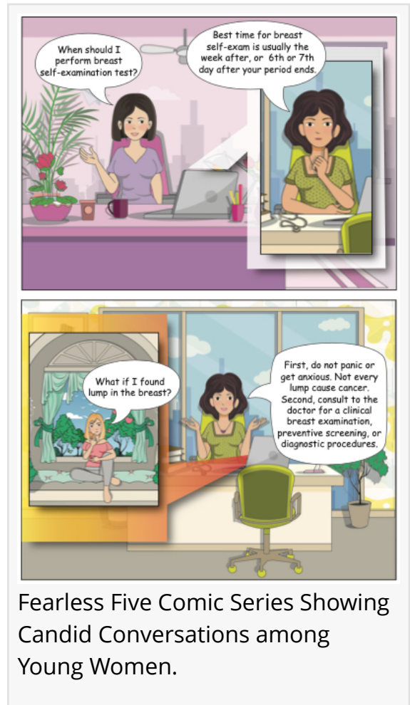
Fearless Five Comic Series Showing Candid Conversations among Young Women.