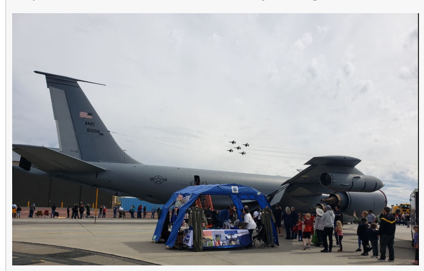
Captain Mama booth at KC-135 at Fairchild Air Force Base, Thunderbirds flying overhead

are visually and mentally immersed as they live an inclusive story of service, curiosity and courage. Graciela's adventurous story-telling, Linda's rich, engaging illustrations and Kiyoshi's origami design activity all meld together to lead you on a lasting journey, with ideas that extend far beyond the end of the book."