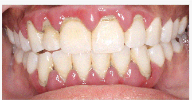
2020 Pretreatment Photo of Swollen, Inflamed Gums