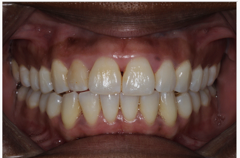
Adding Perio Protect Homecare to Maintenance Appoints Led to Significantly Healthier Gums