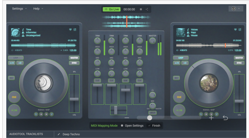
Audiotool Mix DJ Tool

/EINPresswire.com/ -- Cloud based music production software Audiotool is thrilled to introduce Mix , a browser-based DJ tool, which empowers all users to mix any of the 3M+ tracks from the library of Audiotool content and create broadcast channels so others can tune in on a DJ set. In keeping with Audiotool's ethos, Mix is entirely free, accessible to anyone with a web browser.