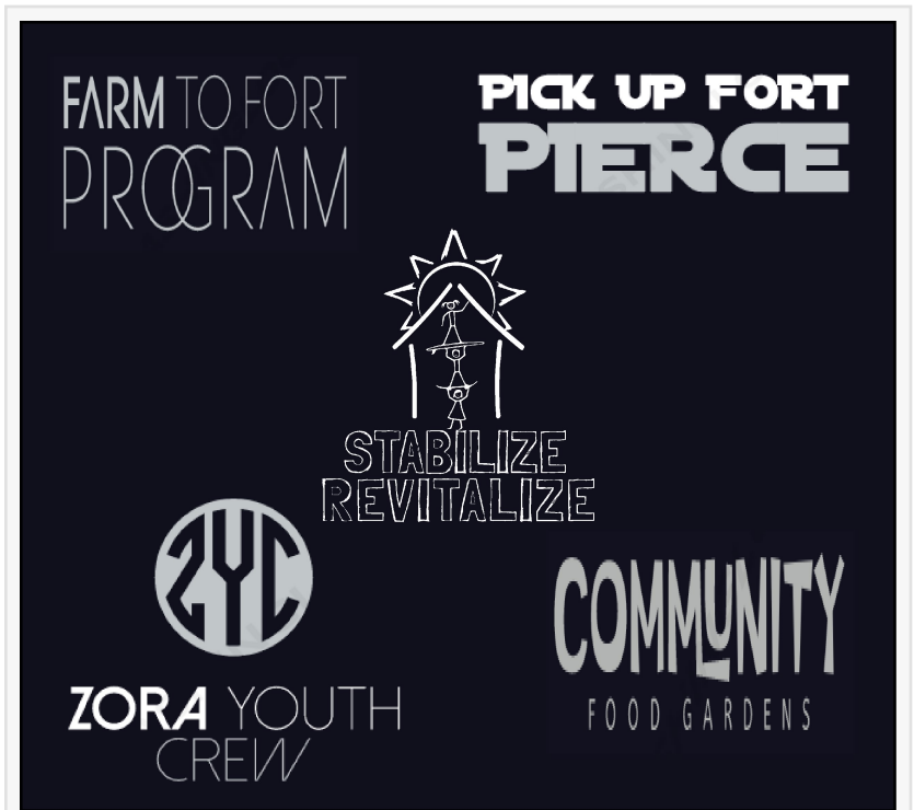
Stabilize revitalize fort Pierce Programs

Join us in supporting a brighter future for Fort Pierce through art, education, and music!