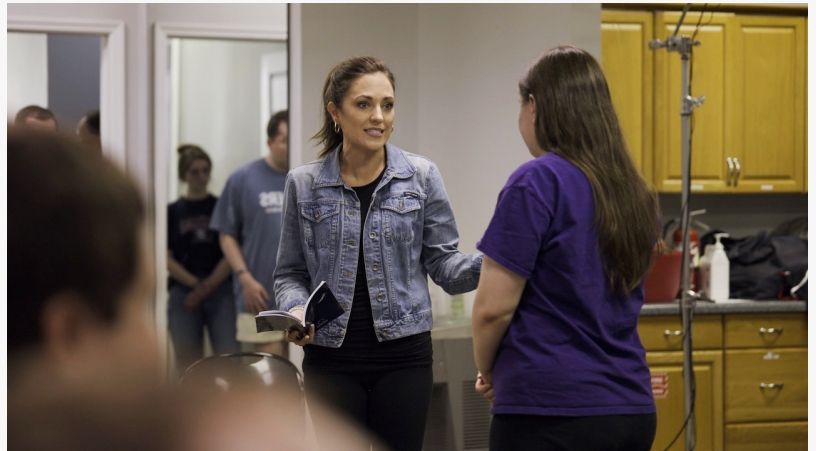
Laura Osnes at rehearsal for Backlight Productions' "Cinderella"