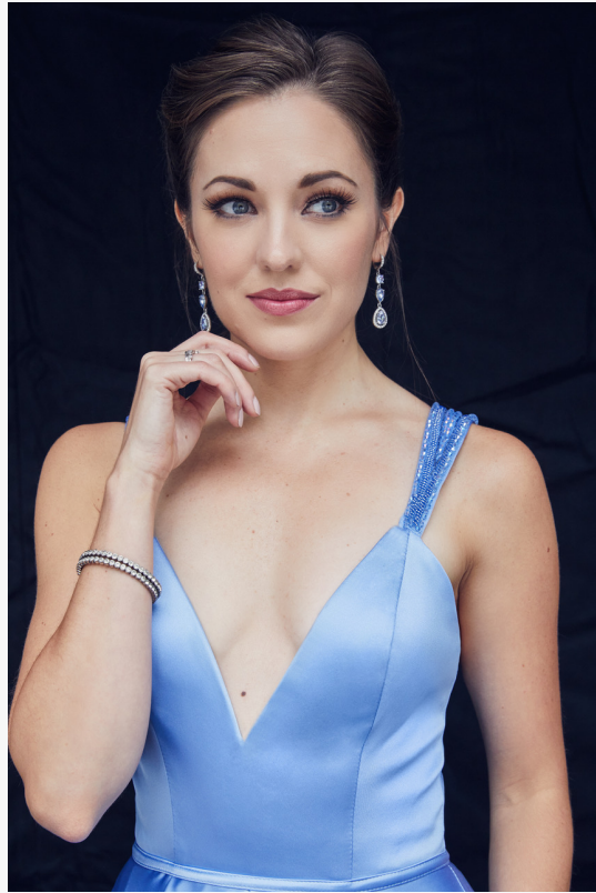
Laura Osnes