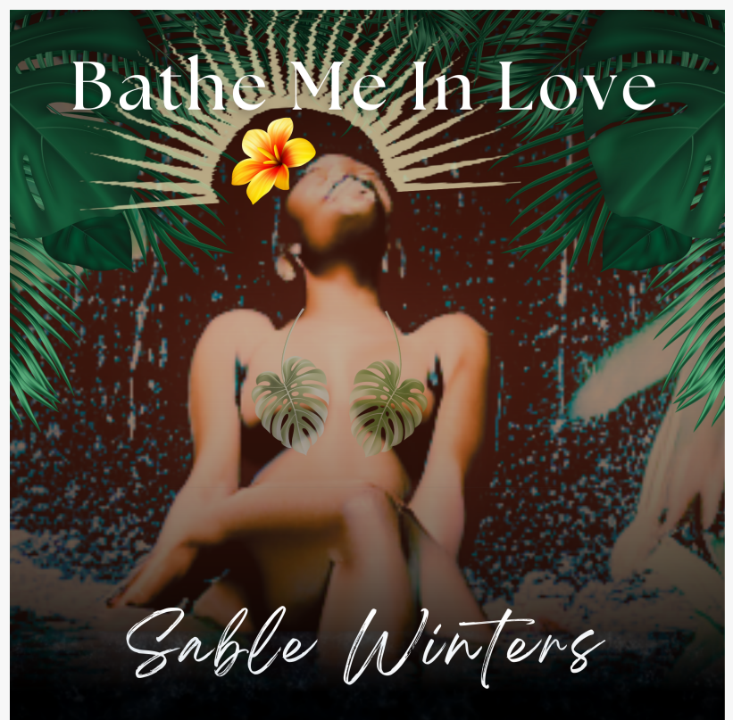
Bathe Me In Love, Single Cover

The song paints an emotional landscape with its tender lyrics and evocative imagery, speaking to the universal longing for a love that not only showers affection but washes away the burdens of the past, leaving the spirit refreshed and ready to love again. Sable's voice becomes the vessel,