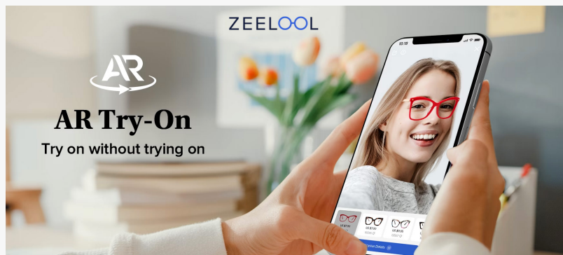
Zeelool AR Try On