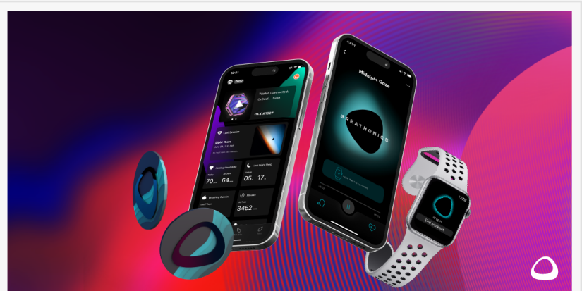
The Breathonics Ecosystem on Apple devices