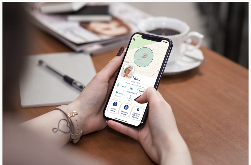
Caregiver Dashboard for Checking the Status of your Loved One