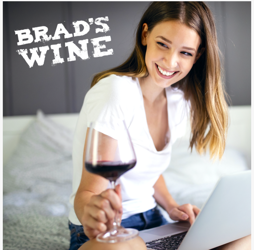
Enjoying Brads Wine