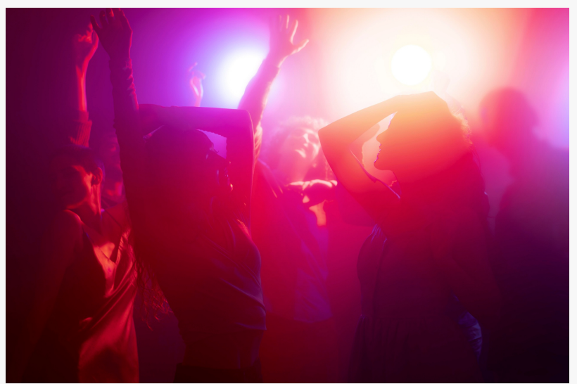
Vibrant downtown nightlife

Azul Escalante Platinum Services +1 5305624032 azul@caboplatinum.com