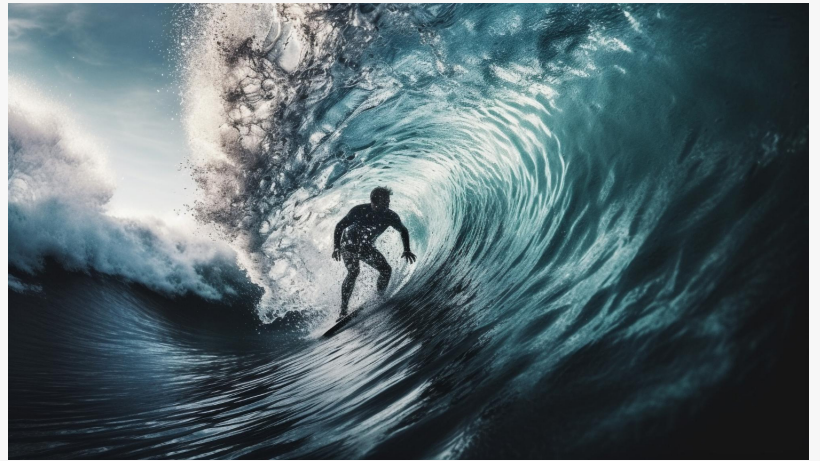
World-class surf beach