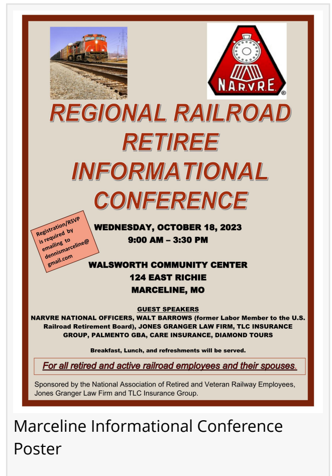
Marceline Informational Conference Poster