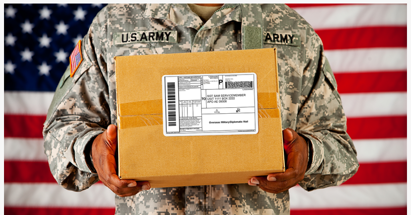
US Soldier Holding Box with Shipping Label

collaboration offers branded boxes, allowing organizations and corporations to both personalize and optimize their military care package shipping process .