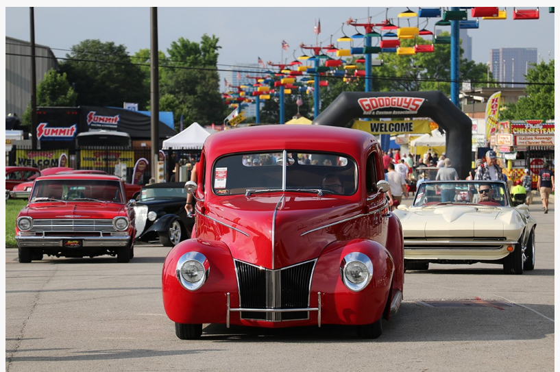
Goodguys Rod & Custom Association has released their 2024 Event Schedule!