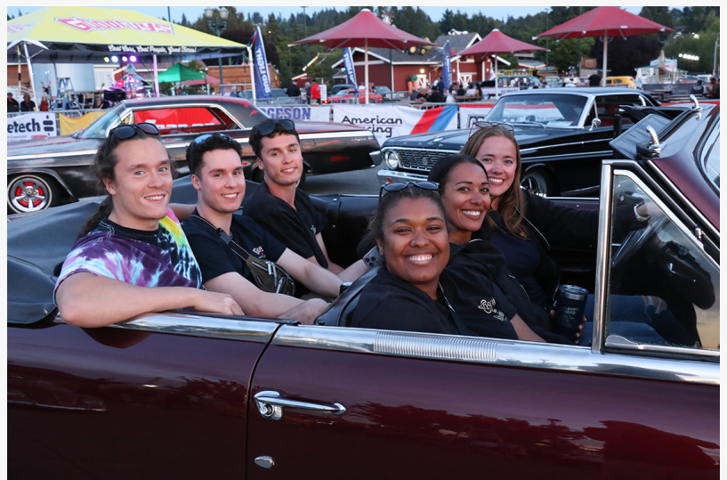
Plan to join the cool cars, cool people and good times with Goodguys Rod & Custom in 2024.