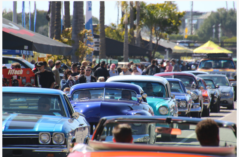
Goodguys Rod & Custom Association has released their 2024 Event Schedule! Make plans to join the fun.