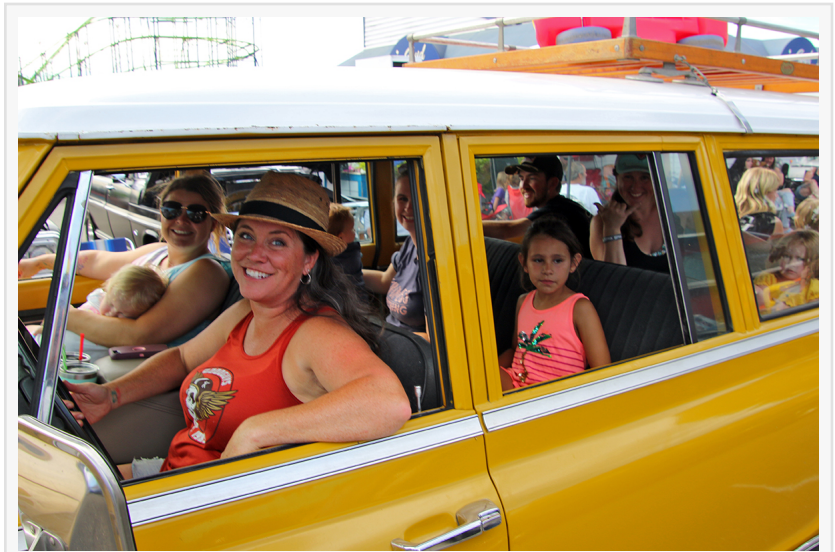
Goodguys Car Shows have plenty of fun for the whole family!