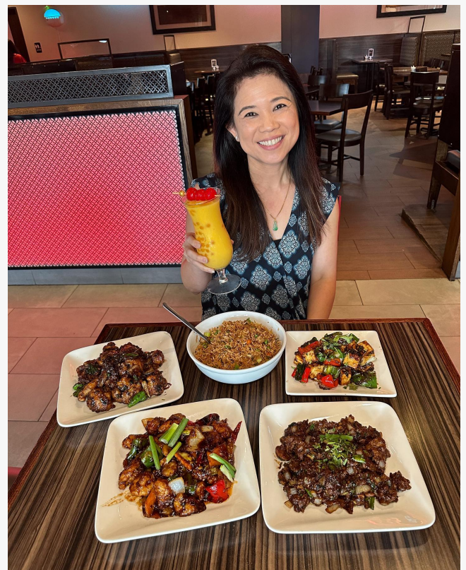
Enjoy your favorite drinks and Indian Chinese dishes at Alings!

This press release can be viewed online at: https://www.einpresswire.com/article/661245590