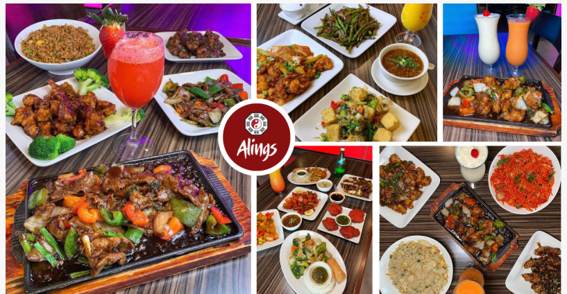
Alings signature Indian Chinese dishes and mocktails