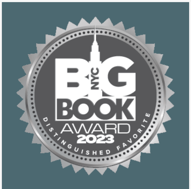
NYC Big Book Award 2023 Distinguished Favorite