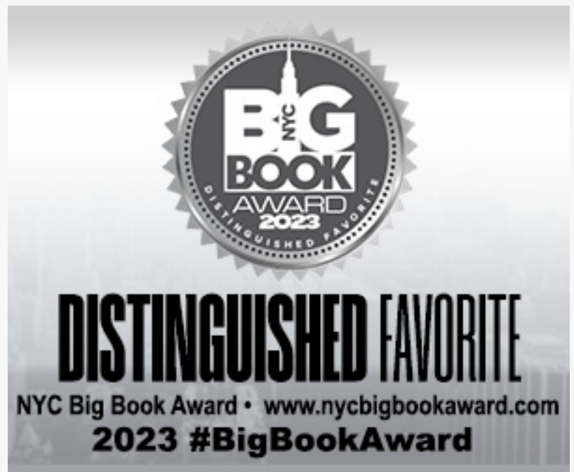
2023 NYC Big Book Award Distinguished Favorite