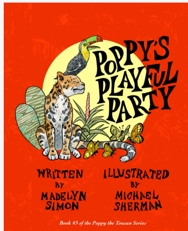
Poppy's Playful Party

The impressive roster of international and domestic entries resulted in a record year for book award winners in major categories. The competition draws a diverse and high-quality pool of authors and publishers. The NYC Big Book Award boasts a worldwide entry pool from Asia, Australia, Europe, and North America. This year, cities such as Ann Arbor, Denver, Edinburgh, London, Los Angeles, Melbourne, Miami Beach, New Delhi, New York, Ottawa, Princeton, San Francisco, San Juan, Singapore, and Winnipeg were represented. Winners were recognized from Austria, Australia, Bangladesh, Canada, England, Germany, India, Israel, Italy, New Zealand, and the United States.