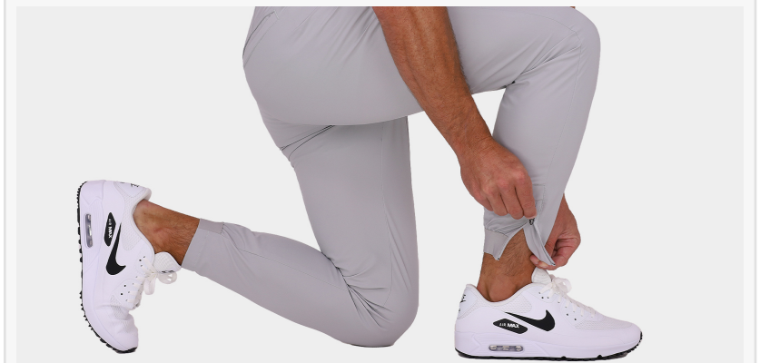
Players Golf Jogger Pants