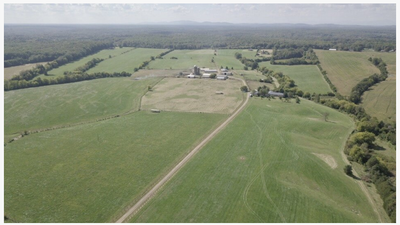
24161 Cockrill Farm Ln., Unionville, VA 22567