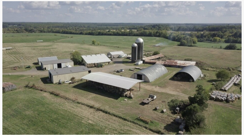
24161 Cockrill Farm Ln., Unionville, VA 22567