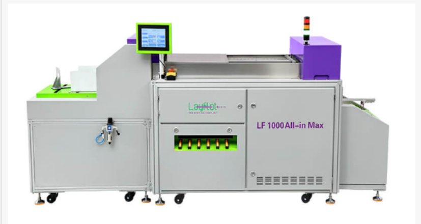
Layflat 1000 All-In Max

This press release can be viewed online at: https://www.einpresswire.com/article/661390056 EIN Presswire's priority is source transparency. We do not allow opaque clients, and our editors try to be careful about weeding out false and misleading content. As a user, if you see something we have missed, please do bring it to our attention. Your help is welcome. EIN Presswire, Everyone's Internet News Presswire™, tries to define some of the boundaries that are reasonable in today's world. Please see our Editorial Guidelines for more information. © 1995-2023 Newsmatics Inc. All Right Reserved.