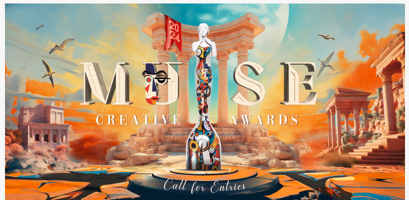
2024 MUSE Creative Awards Call for Entries

Dedicated to honoring, promoting, and celebrating creativity and design excellence worldwide, MUSE has chosen the resonant theme of "Shaping Legacies". This theme aims to highlight the enduring impact and significant contributions of creative minds globally.