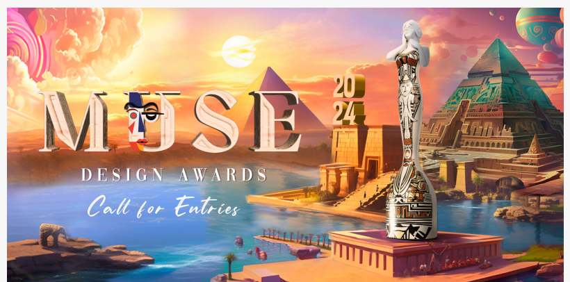
2024 MUSE Design Awards Call for Entries

Participants can submit their works as an individual or as teams. With submission being entirely online, entrants are able to make a submission no matter where they are in the world. A small fee is charged for administrative purposes. Entries will be judged by a jury of international professionals, who will be using the blind judging method so as to judge an entry entirely on its own merits, without being compared to another entry.