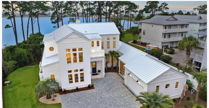
Announcing Ember's Expansion into FL with New Co-Ownership Vacation Home on 30A

SALT LAKE CITY, UTAH, UNITED STATES, October 12, 2023 /EINPresswire.com/ -- Ember, a vacation home experience company that helps people purchase and co-own luxury vacation homes, is proud to announce the expansion of its co-ownership model into Florida with a breathtaking Santa Rosa Beach property located on Florida's scenic Highway 30A. Ember offers buyers the unique opportunity to co-own 1/8 to 1/2 of a beautiful vacation home.