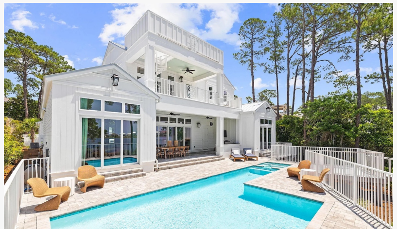
Our 3-level Santa Rosa Beach home features its own dock, pool, spa, upper patio, and observation deck