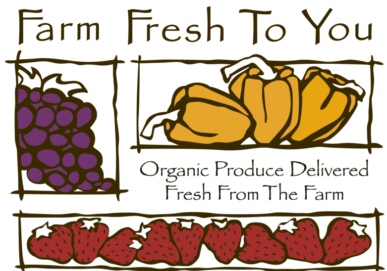
Farm Fresh to You Farm To Table