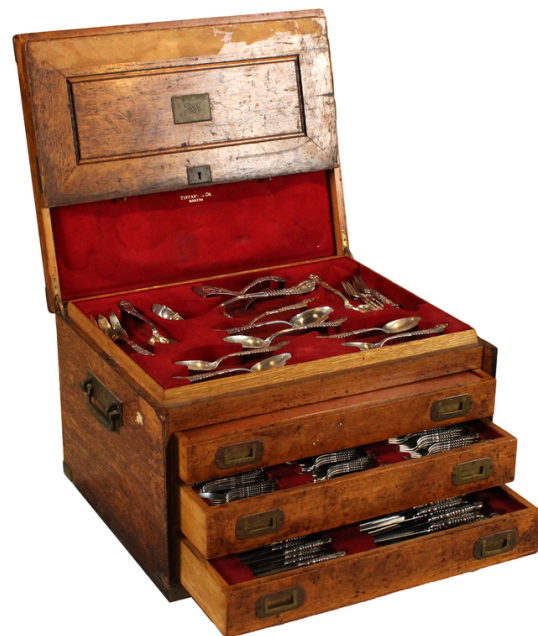
Tiffany & Company sterling flatware service in the "Florentine" pattern, 1905 oak wedding chest.