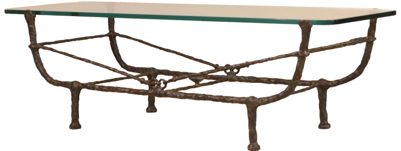
Diego Giacometti (Swiss, 1902-1985), "Table Berceau" second version, designed circa 1965, stamped: "DG."