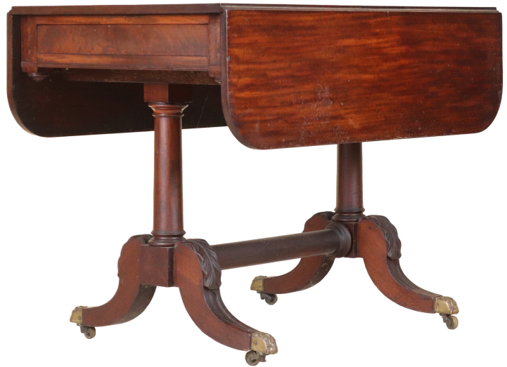
Isaac Ogden classical mahogany Pembroke table, attributed to Duncan Phyfe, New York, circa 1835.

Transitioning to Fine Art, the auction contains a well-balanced mix of traditional through Modern and Contemporary. One of the top lots in the sale is a work by Maria Helena Vieira Da Silva (Portuguese, 1908-1992). This abstract oil is a small, but stoic composition estimated at $6,000-