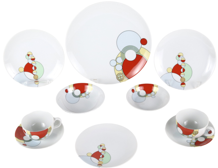
Frank Lloyd Wright (1867-1959), Imperial Hotel porcelain dinner service, Tokyo, Japan.

A nice selection of Arts & Crafts pottery includes a 96-piece porcelain service designed by Frank Lloyd Wright in 1922 for the Imperial Hotel in Tokyo, Japan. The service carries an estimate of $10,000-$15,000. Clarice Cliff and Susie Cooper, the 20th century English