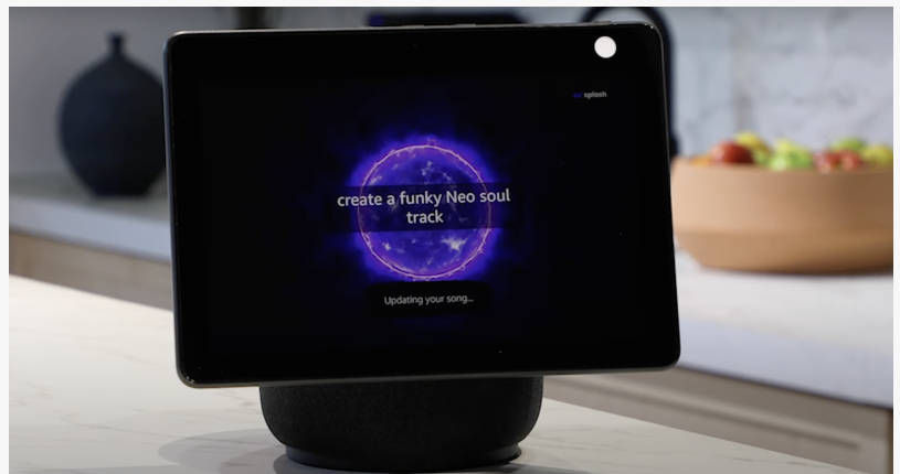
The new Alexa experience is powered by Splash's generative AI technology and proprietary music catalog

This press release can be viewed online at: https://www.einpresswire.com/article/661542062