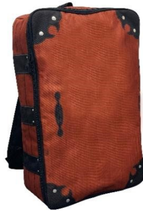
Premium ticket bonus item: Nijigen no Mori original good "Tanjiro's Box-style Backpack"

□[Daytime Event] Nijigen no Mori × "Demon Slayer": "Riddle Walk: The Missing Hashira in Hanafuru-zato"