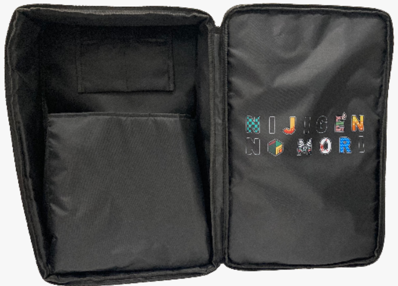
"Tanjiro's Box-style Backpack" (interior)