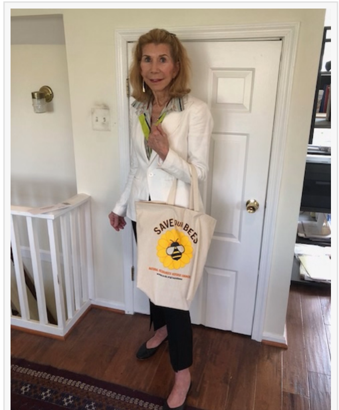
Author with Save the Bees Book Bag

This press release can be viewed online at: https://www.einpresswire.com/article/661601193